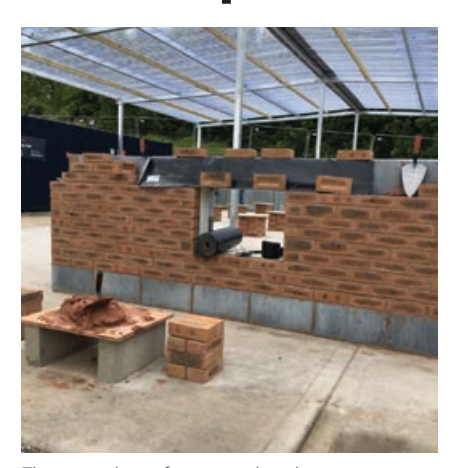
The covered area for practical work.

A new construction industry apprentice training hub has been opened in the West Midlands by the NHBC, supported by Redrow and Tamworth Borough Council.