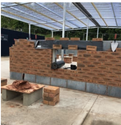
The covered area for practical work.

A new construction industry apprentice training hub has been opened in the West Midlands by the NHBC, supported by Redrow and Tamworth Borough Council.