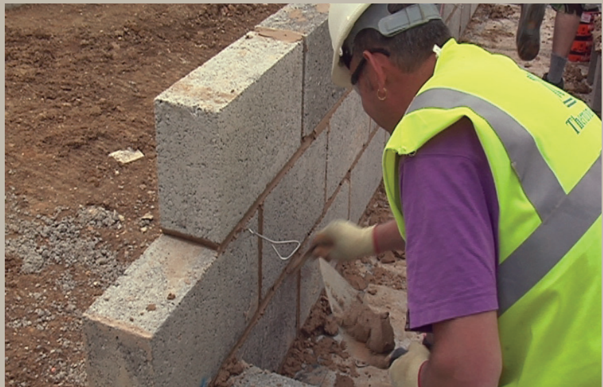
Number of new start builds is improving

While few in the mortar supply industry claim to have seen 'green shoots' when asked about the economy, there does seem to be a feeling that the fall in demand has at least bottomed out.