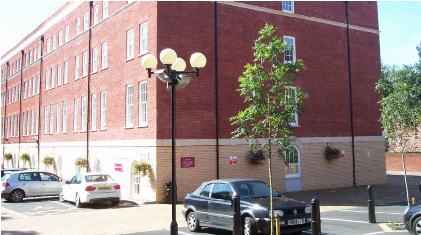
Southgate Hotel, Exeter

Exeter-based building firm Rok has chosen Remix Dry Mortar to supply dry silo mortar for the construction of a new 44-bed extension to the Southgate Hotel in Exeter.